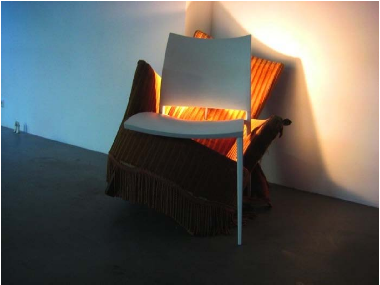
Graham Hudson Chair 2:1 2010 2 chairs, light, fixtures 79 x 78 x 72 cm